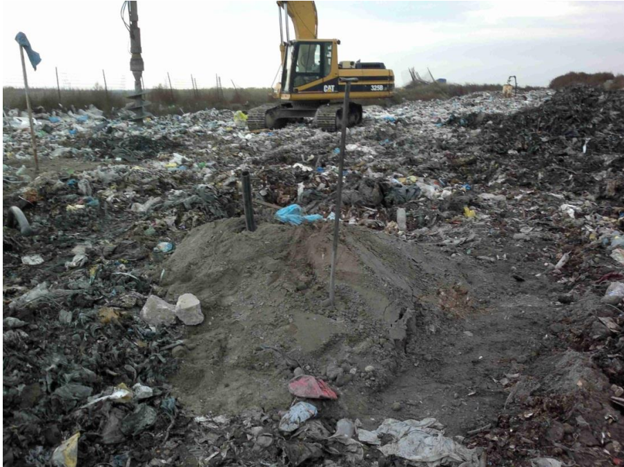
Figure 4. The drilling of vertical heat exchanger wells. In the foreground, the closure of a finished monitoring well can be seen.

Previous temperature monitoring showed us, that the temperature is low in the upper 6 m depth from the landfill surface and below that the temperature increases. Drillings were 16 m depth. In the 800 mm diameter hole, both the downward and the upward pipe sections have to be installed. The inevitable heat exchange between the pipe sections is not good for the heat extraction. Figure 5 shows the concept of the planned vertical heat exchanger.