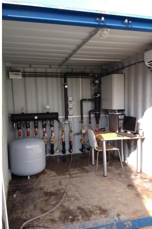
Figure 6. The engine-house and the installed mechanical engineering equipments.

The metal container is functioning as engine-house and ensures the flexibility of the system, because each incoming (from “slinky” and “ladyfinger” type of heat exchangers as well as from vertical wells) and passing (to greenhouse and leachate pond) pipeline pairs were connected to the main pipes laying in the engine-house (Figure 6). The operation of each pipe system can be controlled by the taps and valves.