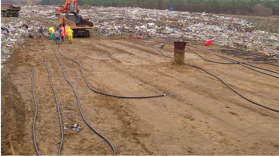
Figure 2. The preparation of the area before laying down the horizontal heat exchanger pipelines.