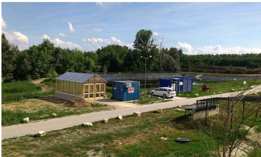
Figure 7. The built greenhouse, the container functioning as engine-house and the leachate pond.

A floating coiled pipeline was designed into the leachate pond with similar arrangement to the “ladyfinger” type of heat exchanger. This pipeline consists of 4 x 20 m long straight sections with three 2 m diameter reversing parts. The tubes were held by cross rods made by stainless steel with 4 m spacing. The hubs were equipped with buoys in 0.5 m long distance chains so the heat exchanger pipeline filled with working liquid can be sink in maximum 0.5 m depth in the leachate pond. The built greenhouse was equipped with a conventional heating system with radiators.