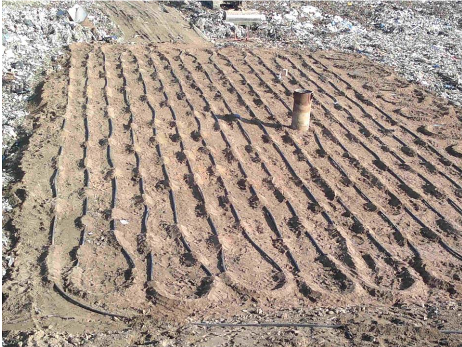
Figure 3. The “ladyfinger” (left) and the “slinky” (right) types of heat exchanger pipelines.

Electrofittings were used on site to connect HDPE pipes. The network of pipeline was configured in such way that the highest point was reached on the slope. The height of pipeline is monotonically decreasing in the direction of the heat exchanger and the pump.